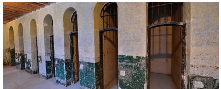
On the lowest level, six jail cells have been retained to give the public a sense of former living conditions in the jail. A couple times a year the public will be allowed to view the punishment and death row cells, and the former gallows tower located on the second floor of the east block.