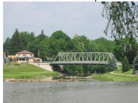
HARTMAN BRIDGE, NEW HAMBURG