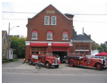
Fire Hall - Doors Open 2006

horses' feed above. A fire alarm bell would sound alerting the horses to kick open the swing doors to stand beneath the harnesses that hung from the ceiling to help speed the fireman away to the scene of the fire. The common kitchen was on the ground floor. The large second floor allowed each fireman to have his own room with the highest ranking officer having a corner room with two large windows. The third floor was mainly for storage. Fire Station No. 2 was an active fire station until 1964. After several owners including automotive businesses, Station 2 Studios purchased the building in 2004 for a live/work space.