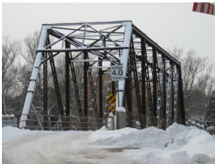
BLACKBRIDGE ROAD BRIDGE, CAMBRIDGE (HESPELER)